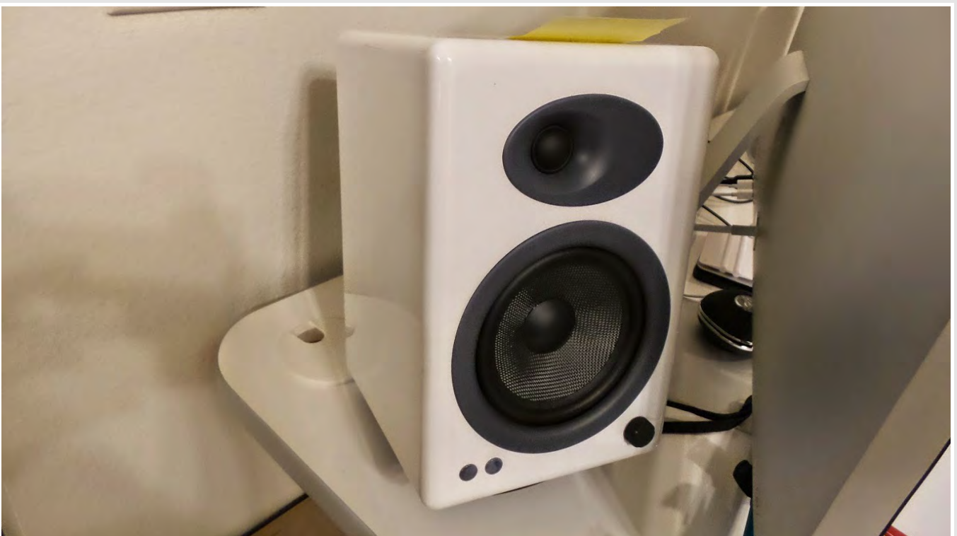
MY AUDIOENGINE 5+ SPEAKER

OK... what about this Bluetooth speaker you ask? Well, let's dive in shall we?