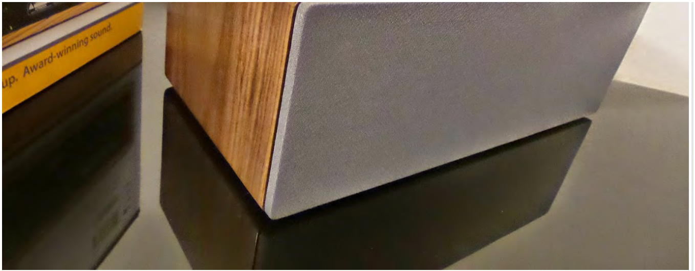
AUDIOENGINEB2 PREMIUM BLUETOOTH SPEAKER

I have touched many-a-Bluetooth in my day, and have felt others that were solid as well, but then when I turned them on, they disappointed me! These did not! For a speaker that retails at $299.00 , all I was thinking is... this thing better pack a MEAN punch!!