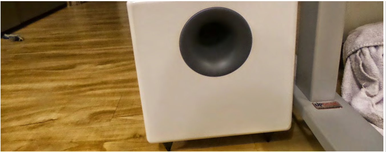
MY AUDIOENGINE S8 SUB